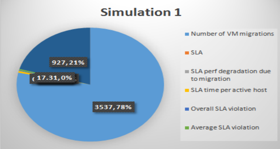
Fig.2. Bar chart for Experiment 1